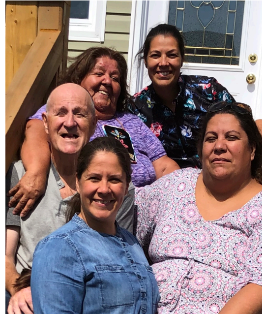
Richmond Family August 2019

Anishnaabe people will hold a four-day sacred fire to support and honour the spirit as it passes from this world to the next. But in mid-December, the weather was menacing. We sought direction on our obligations, and we were soothed by our teacher who told us dad had adequately prepared for his death in the last several months and his spirit had safely moved on. We were relieved. We wanted to honour dad, but at that time we were not capable of holding a four-day fire. Nor were we ready to part with his ashes. The act of holding on to and protecting his ashes felt like the most honourable thing we could do. We agreed that we would fulfill our ceremonial obligations and send dad "up the river" when the time was right. Little did we know how global events would impact this process in the coming months.