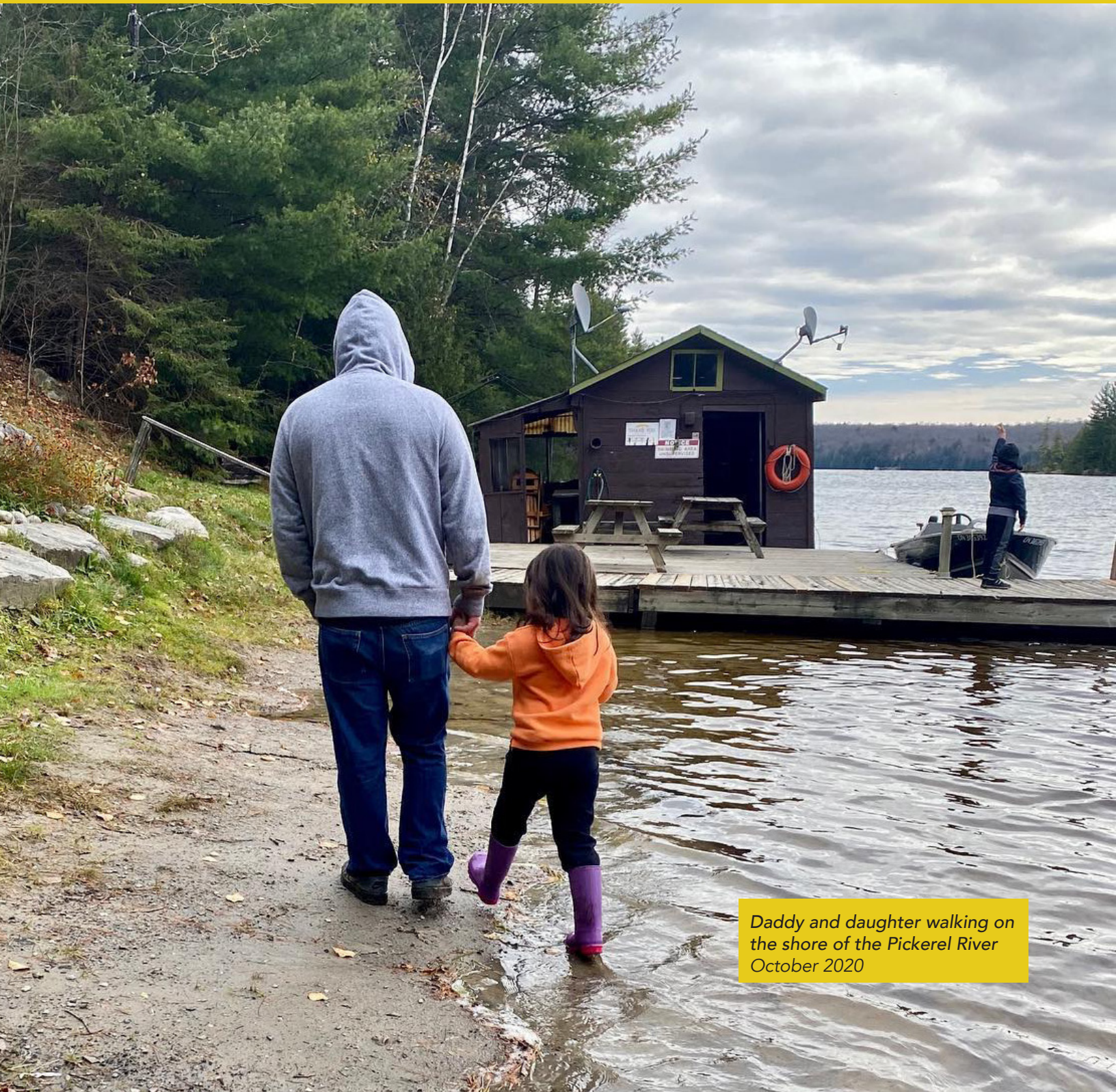
Daddy and daughter walking on the shore of the Pickerel River October 2020