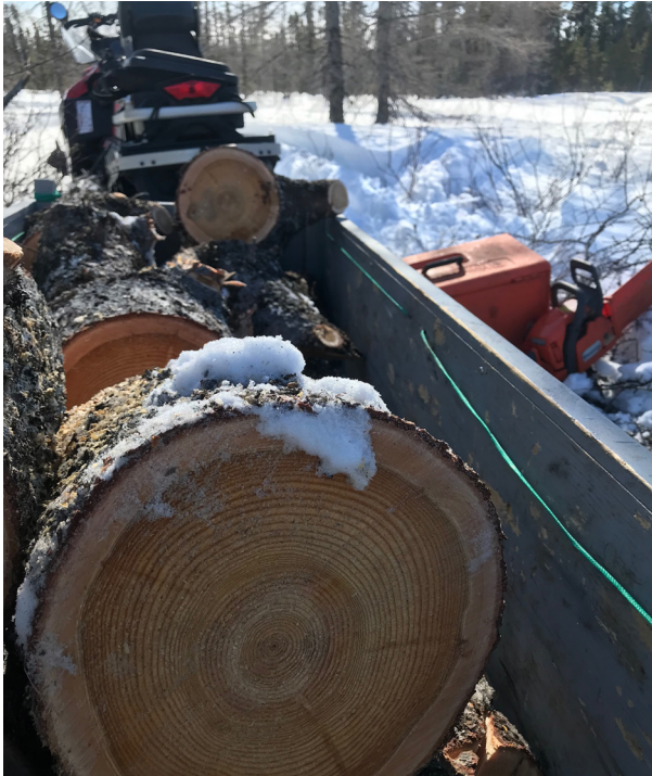
A full komatik load of freshly cut juniper May 2020

Throughout the early days of the pandemic, I kept thinking about what I learned in Rigolet and my desire to reconnect to and learn from the land. If I had to work in isolation and practice social distancing, I decided it might as well be in a small cabin near a woodstove with my laptop. Each day, I'd snowmobile to our cabin, light the fire, and do my work. As each day passed and this new pattern provided a sense of wellness and gratitude, I started to explore more and more around Lake Melville after work. I was going where so many others were going on the land during this pandemic, but I was also making my own tracks, and that felt liberating.