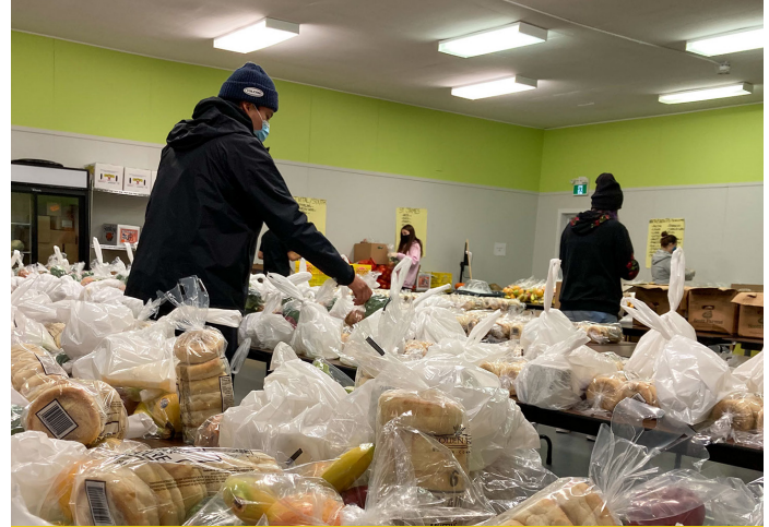
Ma Mawi Chi Itata Centre

Today, Ma Mawi Wi Chi Itata focuses on four areas: running its Community Care Centres as safe spaces for families to access services; ongoing work in child welfare and with children who are at risk of, or who have been, apprehended; investing in youth through cultural programming; and, Indigenous knowledge- centered programs delivered through its healing and learning center. Community Care Centres are located where the proportion of Indigenous families living there is high, in 16 locations throughout the city. Last year, Ma Mawi Wi Chi Itata served 35% of Indigenous people located in Winnipeg, or just under 30,000 people.