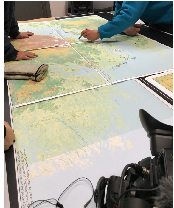
Community open house and Inuit knowledge mapping in Rigolet March 2020

This brings me back to Rigolet, where I was sitting by the fire doing a conversational interview with an Inuk Elder and hunter who generously spent a couple of hours with me providing his passionate thoughts about caribou, but also about passing on knowledge and maintaining his own land skills: "Well, let me give you one bit of advice when it comes to being out on the land." I lean in and listen: "Don't be chasing me around all the time, make your own tracks. Get that confidence. Don't be scared if you go off the road a little way, make the wrong turn, or go around the wrong point. Just as long as you don't go in the water. That's how you learn, doing stuff on your own, you know, whether it's putting up a tent or cutting down a stick of wood, or take a stick