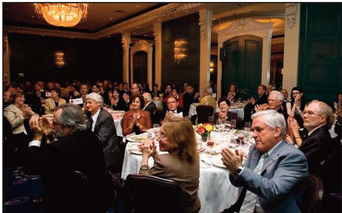
RSC's Fundraising Gala, Toronto, October 17, 2007